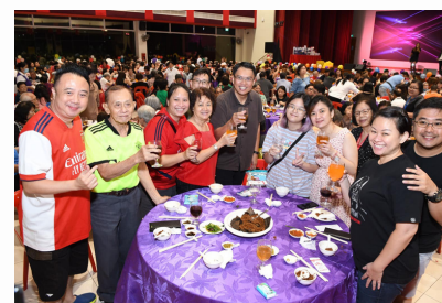
Parents' Day Dinner 2023