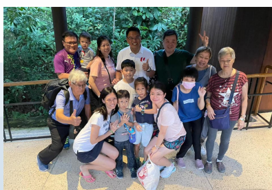
Pioneer Goes Safari