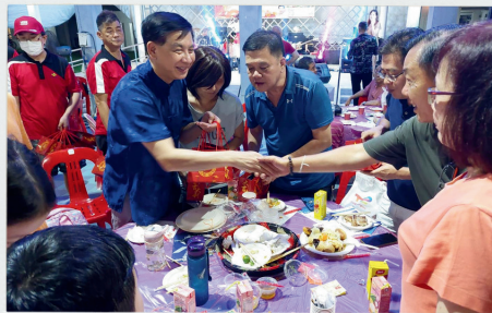
Lunar New Year Festivities