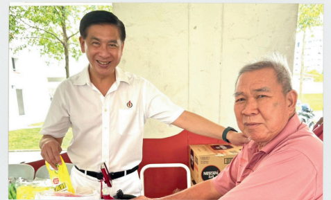
Household Packs Distribution