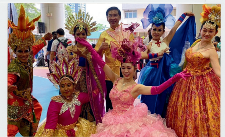
Chingay @ The Heartlands