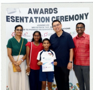
Education Merit Awards Ceremony