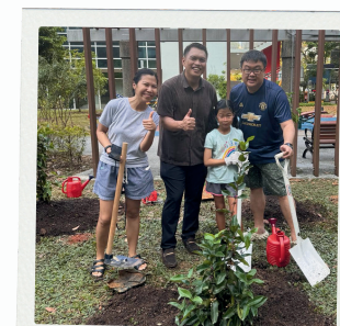
Monthly Tree Planting

For senior residents seeking greater convenience and navigating age-related challenges, I am pleased to share HDB's Enhancement for Active Seniors (EASE 2.0). The recent enhancements includes bidet sprays installation and lowering of toilet entrance kerbs. These modifications will significantly improve safety and mobility for our seniors at home. I strongly encourage our seniors to find out more from the official HDB website. Do approach our volunteers and constituency staff if you need help.