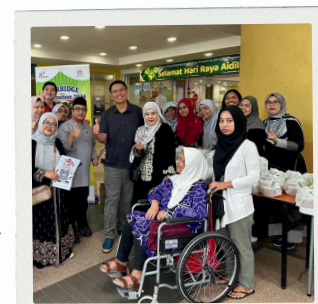
Ramadan Porridge Distribution

Thanks also to our Malay Activity Executive Committee and our various grassroots teams, we were able to distribute porridge to our Pioneer Constituency residents, spreading warmth and community spirit during the month of Ramadan. We have also started an open-mic initiative called "Pioneer Crescendo" and just completed the first show on Mother's Day weekend at the ever popular Jurong Point/Boon Lay MRT station. Look out for more innovative events coming your way!